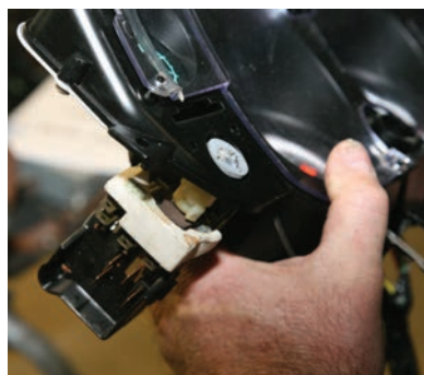
15. When you're reinstalling the headlight switch, take care not to overtighten the retaining nut. It's plastic and will break if you gorilla tighten it.