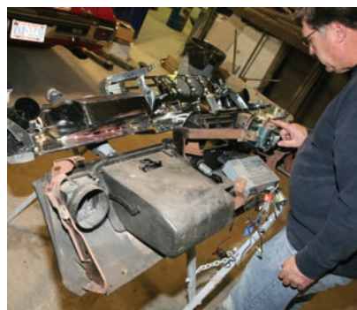
8. You don't necessarily have to pull the whole dash assembly for swapping in the Classic Instruments gauges, but ours was looking pretty worn and tired, so we decided to swap it out for one of Ground Up Restorations new carriers, part no. IJ-70VC. Instead of silver painted plastic bezels, the Ground Up carrier features chrome plating on all the plastic, correct grain and accenting on the black surfaces, and side air vent assemblies pre-installed.