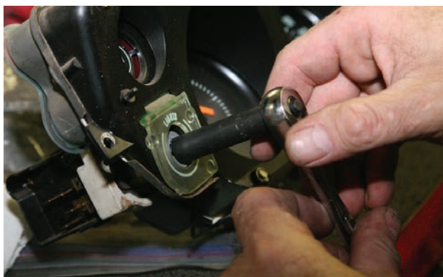
12. The headlight switch is attached to the gauge cluster, and usually needs a special socket to remove its retaining nut. Sometimes you can get away with using a nickel for this.