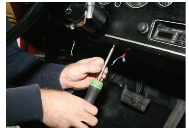
4. Next up, the steering column cover plate has to come off.