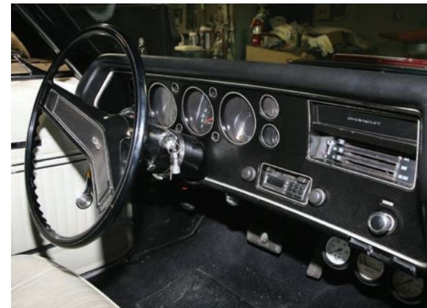
1. This was our starting point. Even though the car is an automatic, the lack of a factory tach is still a bit depressing, along with no oil pressure or temp gauge to give warning for trouble under the hood before it turns catastrophic.

Our subject Chevelle featured that bare minimum for an SS when it came to gauges, with only a fuel and speedo in the middle, and idiot lights for any of the peripherals. Besides making for a rather boring thing to look at, while cruising there was no way to know what was going on with the engine until it might be too late. Plus, we were tired of looking at the cheap parts store tach and accessory gauge trio a previous owner had thrown in. Wanting a little more than stock readouts, and not caring about the clock's absence, we decided to go with the Classic Instruments cluster that featured green lettering/numerals on a black face, to better go with our stock interior. Follow along as we show you how easy it is to install the kit.★