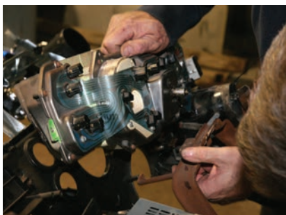
9. The original gauge cluster comes right out after removing a few screws.