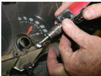
10. The Classic Instruments unit doesn't come with the plastic lens face, and we forgot to order one (part no. IJ-902) from Gorund Up along with our dash carrier. The original was in good shape, so we decided to reuse it. To get it off, the plastic rivets holding it on were carefully ground down to free it from the gauge assembly.