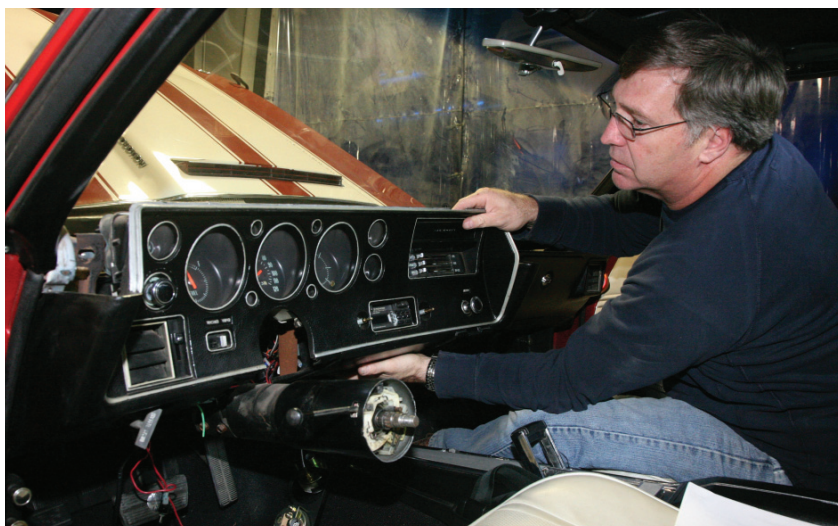
7. With the column lowered we unbolted the dash from the firewall, pulled it far enough out to disconnect all the related wiring, then took it all the way out.