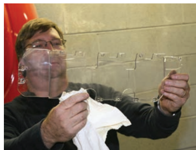
11. Before installing the lens on the new gauges, we made sure it was spotless and free of any dust or fingerprints.