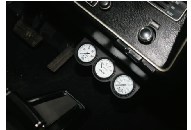
2. Typical of most muscle cars lacking factory accessory gauges, the previous owner added these white face el cheapo ones along with a budget parts store tach on the steering column installed with a big hose clamp.