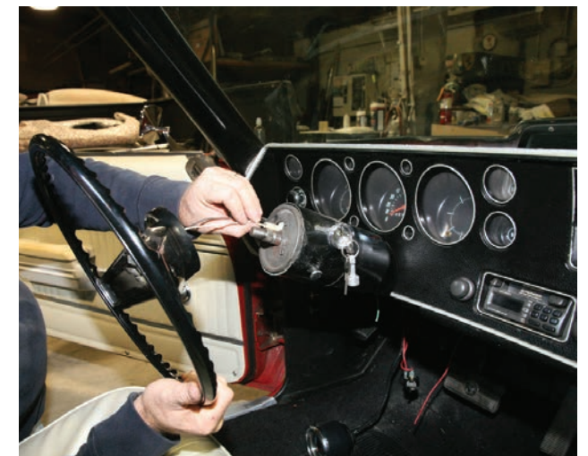
6. To give us more room to work, we removed the steering wheel before lowering the column out of the way. Sometimes you'll get lucky like we did and the wheel will pull right off the splines. If not, you'll need a dedicated steering wheel puller, available for rent at most local parts stores.