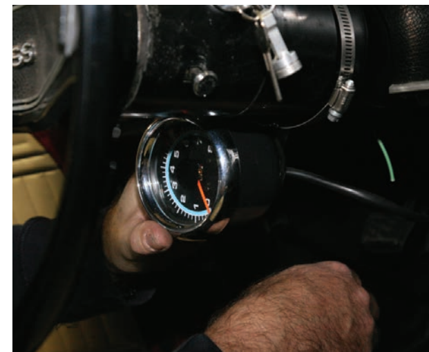
5. With the coverplate out of the way, we cut the wires to the tach and pitched it in the trash.