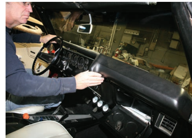
3. The first order of business is removing the dashpad. Just a few screws hold it in.