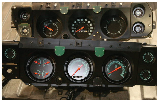
13. Here are the old and new together. Instead of just two gauges and a trio of idiot lights, the Classic Instruments panel gives us six gauges. Before installing the cluster lens, make sure the gauge faces are completely clean of any packing dust or debris.