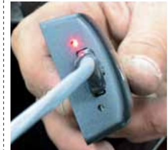
The "red" light means you have power and are ready to begin the calibration.