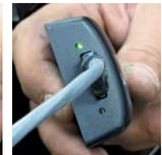
The "green" light means your Sky Drive has picked up the satellite signal and your speed/ odometer is ready to go.